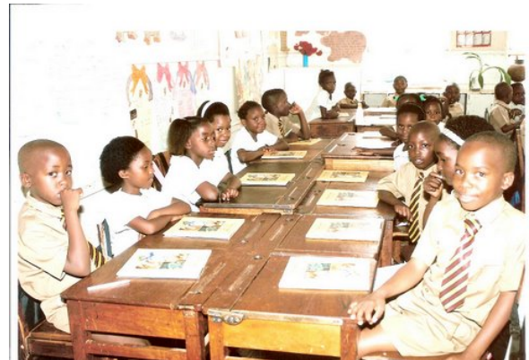
Using Forever Poems for Now and Then in the classroom to teach poetry