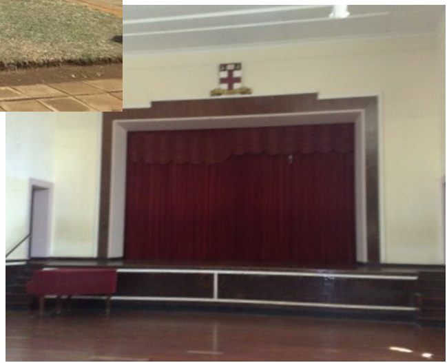
Playground, Courtyard, Theatre